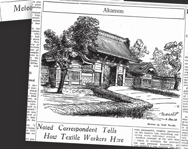
Noted Correspondent Tells How Textile Workers Here Drawn by Noel Nouet.