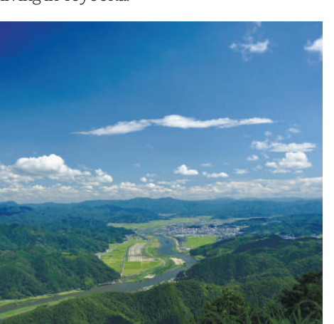
The city of Toyooka is seen in this aerial photo.

City." Using the city's activities as a driving force, such as reviving the natural stork population and bringing theater and other art forms to the city, we will continue to further advance the excellent benefits of living in Toyooka.