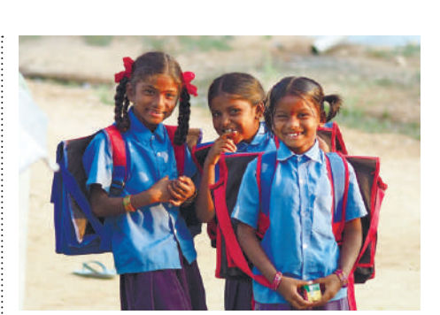
Indian girls smile in 2018 in southern India where ACE works to resolve child labor issues.

guarding of more children from dangerous and harmful labor and ensure wider access to quality education.