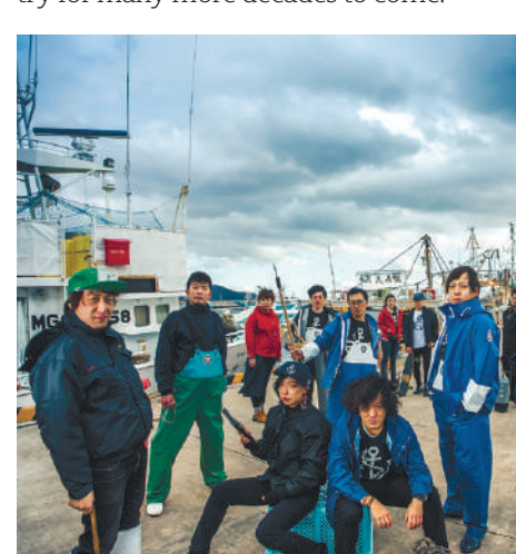
Fisherman Japan has not only young fishermen, but also professionals who design, take photographs, dive and cook, as its members. FISHERMAN JAPAN

of doing so. We'll try to create as many options as possible for the fisheries industry for many more decades to come.