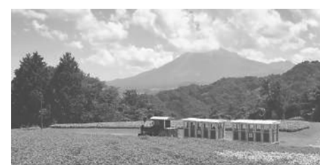
Tottori Hanakairo TOTTORI HANAKAIRO

Interest in nature and greenery has been growing in urban areas in recent years, and spending time around flowers and plants has increasingly become a source of comfort and relaxation for many people. The Tottori Flower Garden is expected to serve not only as a place for Tokyo residents to experience Tottori's natural beauty and floral culture, but also as a space that encourages people to rediscover the value of flowers and greenery.