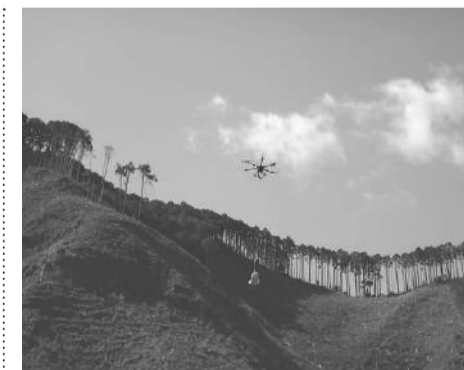
A drone used to transport materials in operation NAKAGAWA

The company has additionally introduced large drones to transport materials through mountainous terrain, reducing the physical