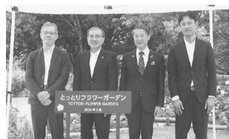
Participants at the opening ceremony with Tottori Gov. Shinji Hirai (second from right)

Tottori Hanakairo opened in 1999 and spans an area equivalent to 11 Tokyo Domes. Situated at the foot of Mount Daisen, the highest peak in the Chugoku region, the park is renowned for its lush natural surroundings and seasonal floral displays. It features a large dome that allows visitors to enjoy flowering plants year-round, expansive flower fields, a circular corridor and dedicated seasonal exhibition zones. Tulips in spring, lilies in summer, salvias in autumn and winter illuminations create an ever-changing landscape. Thanks to its convenient access — about a 25-minute ride on a free shuttle bus from Yonago Station — the park attracts visitors from across Japan.