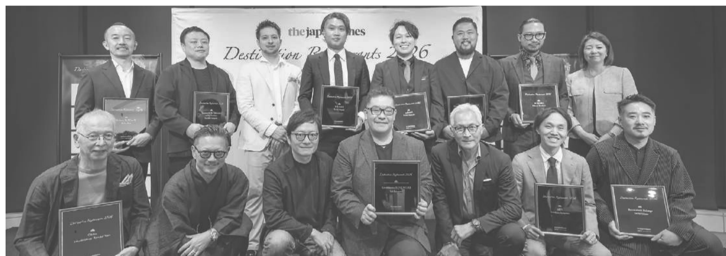
All of the Destination Restaurants award-winning chefs for the 2026 cycle pose with the judges and the event organizer.